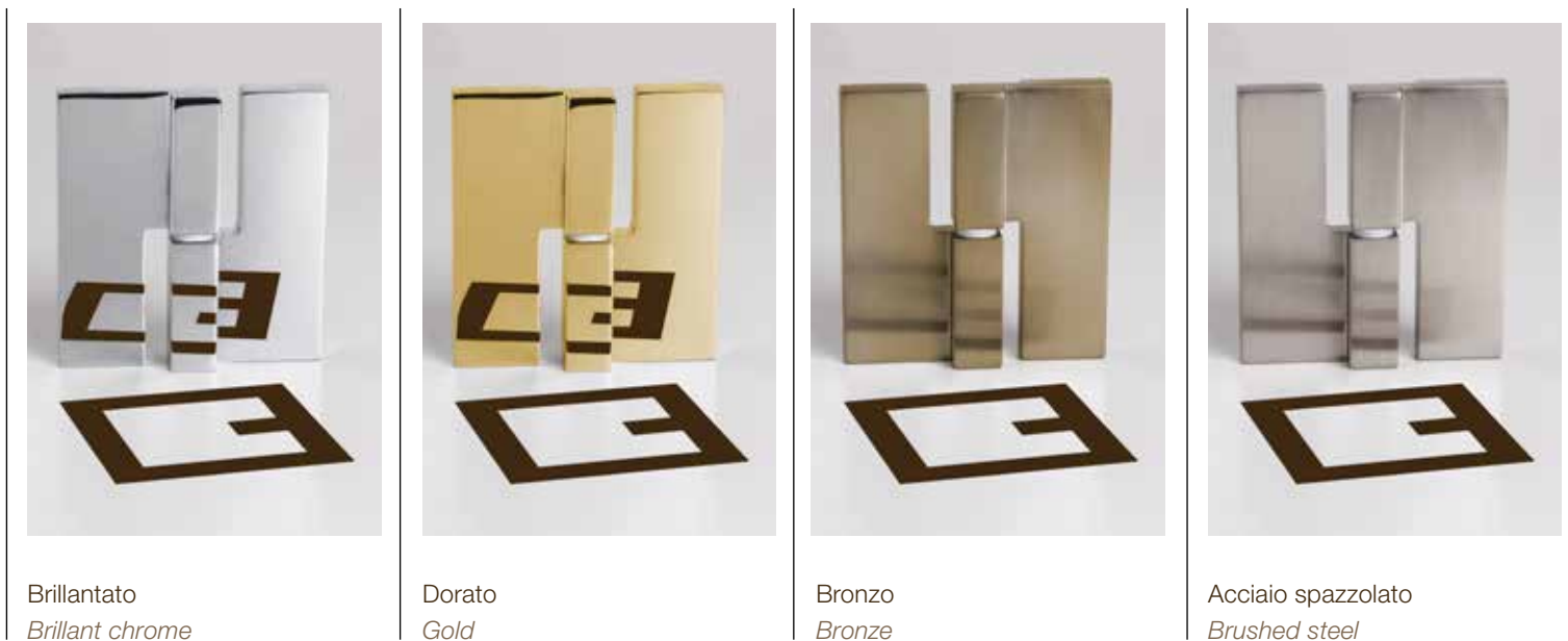
Brillantato Brilliant chrome