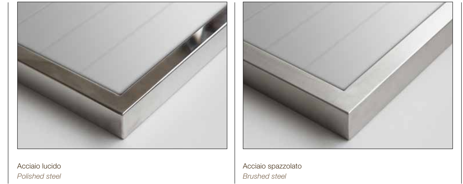
Acciaio lucido Polished steel